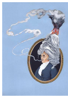
Liar Liar Wig on Fire